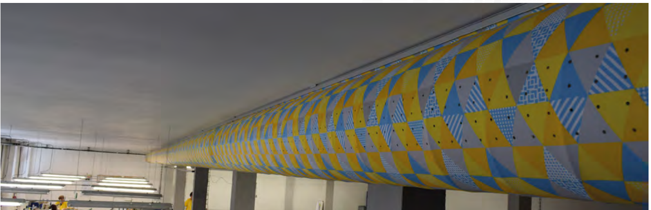
Helix reinforcement + Prihoda Art