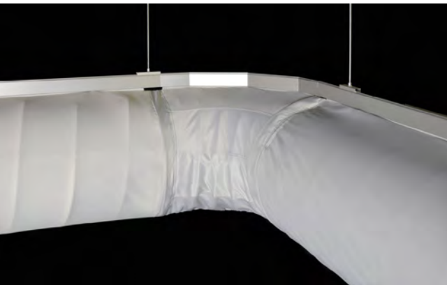
Helix supported elbow