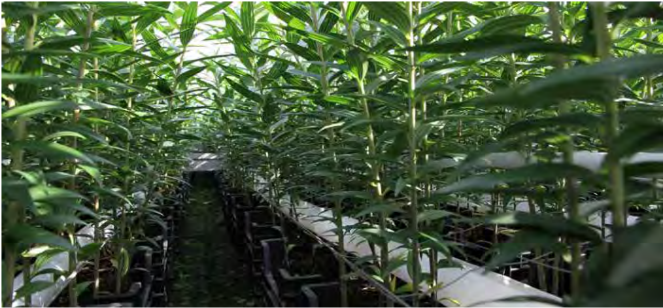
Ventilation at the plant level provides even, consistent temperature and humidity underneath the grow canopy ensuring correct transpiration rates