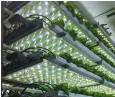
Vertical diffuser systems with precision, rack-level air distribution for top-to-bottom temperature and humidity consistency in any size vertical grow operation