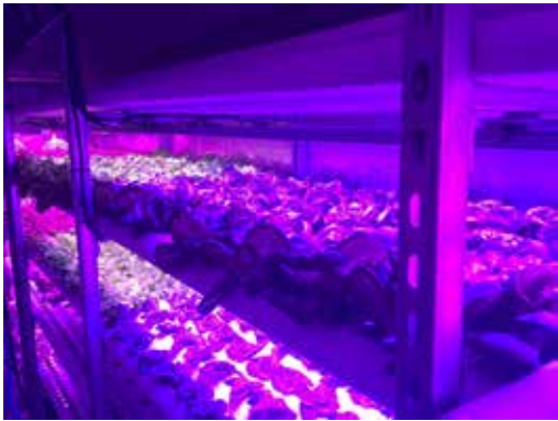
Highly customizable system design allows for ideal conditions on every rack in container operations.